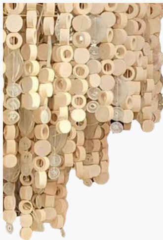
NATURAL W CLEAR GLASS