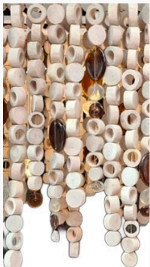
NATURAL W CLEAR & BROWN GLASS