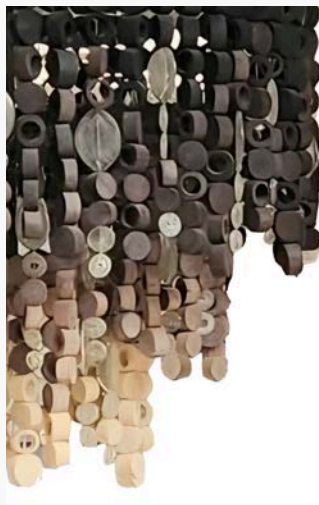
OMBRE W CLEAR GLASS