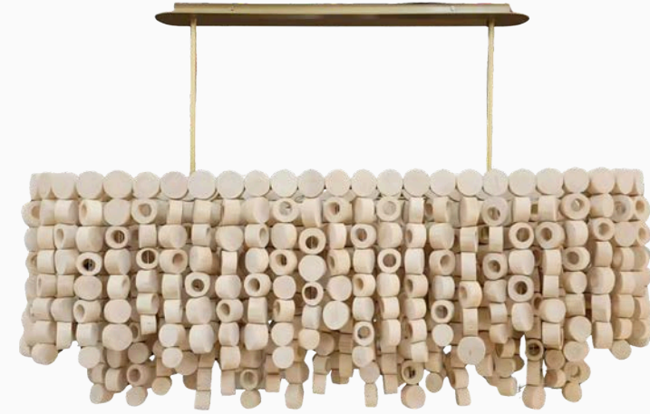
OVAL DISK 2-TIERS 120 COLOUR: NATURAL 120CM X 42CM D X 45CM H X 32KG 5 X E27 GLOBES (ambient light) 2 PAIRS OF CHAIN AT 1M OR ROD W PLINTH