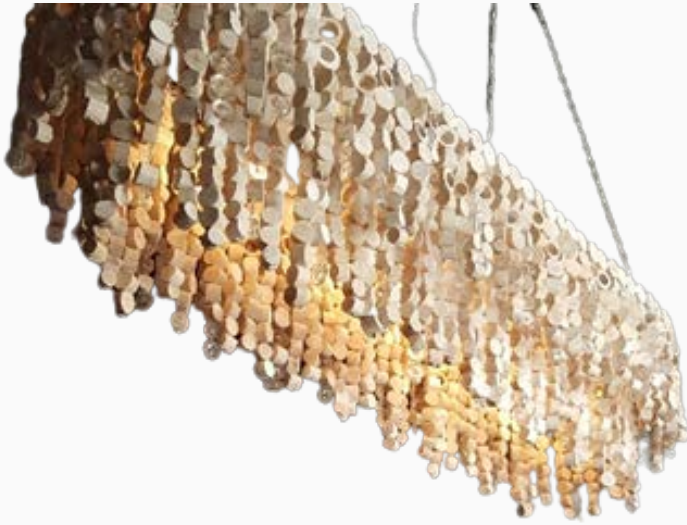
OVAL DISK 2-TIER 160 COLOUR: WHITE-WASH 160CM X 42CM D X 45CM H X 32KG 5 X E27 GLOBES (ambient light) 2 PAIRS OF CHAIN AT 1M

AVAILABLE DISK & CHIAN COLOURS ON LAST PAGE