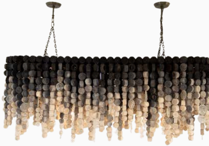
OVAL DISK W 2 LAYERS AT SAME HEIGHT COLOUR: OMBRE W CLEAR GLASS DISKS 160CM X 42CM D X 65CM H X 36KG 5 X E27 GLOBES DIFFERENT HEIGHTS (ambient light) 2 PAIRS OF CHAIN AT 1M