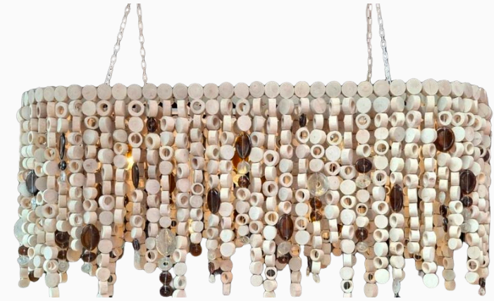
OVAL DISK W 2 LAYERS AT SAME HEIGHT COLOUR: NATURAL W BROWN AND CLEAR GLASS 160CM X 42CM D X 65CM H X 36KG 5 X E27 GLOBES DIFFERENT HEIGHTS (ambient light) 2 PAIRS OF CHAIN AT 1M