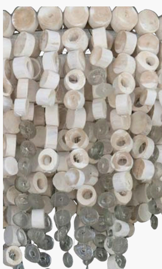
WHITE WASH W CLEAR GLASS