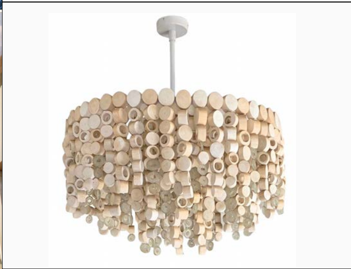
ROUND DISK WHITE WASH W CLEAR GLASS 76CM DI X 45CM H X 15KG 5 X E14 GLOBES (ambient light) X3 CHAINS AT 1M OR ROD AT 40CM