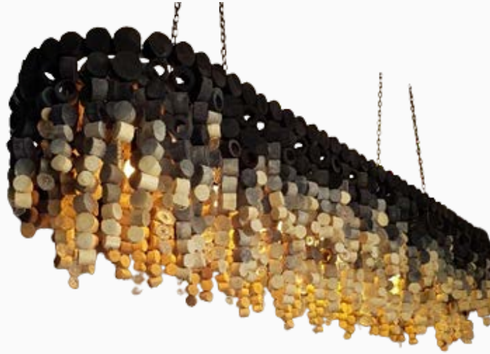
OVAL DISK 2-TIER 160 COLOUR: OMBRE W CLEAR GLASS 160CM X 42CM D X 45CM H X 32KG 5 X E27 GLOBES (ambient light) 4 CHAINS W 2 CEILING CUPS (2 CEILING JOINS)