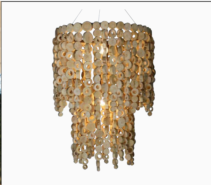
ROUND DISK 2 -TER NATURAL 60CM DI X 80CM H X 17KG 4 X E27 GLOBES (ambient light) X3 CHAINS AT 1M