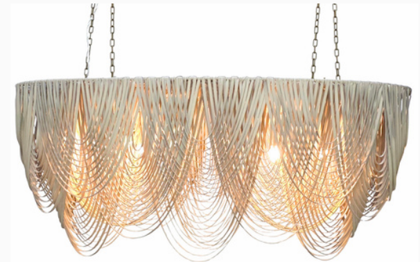
WSP OVAL 140 - CREAM LEATHER 140M DI X 60CM DEEP X 75CM H X 15KG 4 X E27 GLOBES (ambient light) X4 CHAINS OF 1M + X2 CEILING CUPS