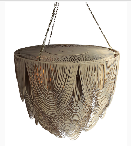
WSP FLAT 82 - CREAM LEATHER 82CM DI X 75CM H X 16KG 5 X E27 GLOBES (ambient light) X3 CHAINS AT 1M