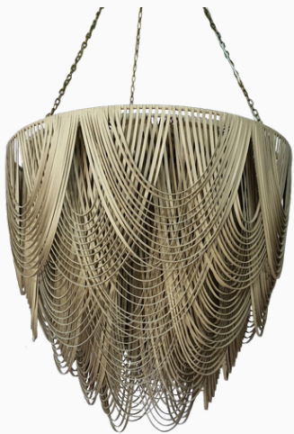
WSP FLAT 92 - CREAM LEATHER 92CM DI X 86CM H X 18KG 5 X E27 GLOBES (ambient light) X3 CHAINS AT 1M