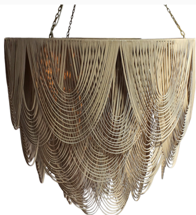
WSP FLAT 120 - CREAM LEATHER 120M DI X 113CM H X 23KG 11 X E27 GLOBES (ambient light) X4 CHAINS AT 1M