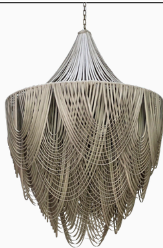
WSP T 92 - CREAM LEATHER 92M DI X 1.35M H X 20KG 6 X E27 GLOBES (ambient light) 1M CHAIN