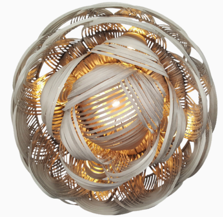
WSP FLAT 72 - CREAM LEATHER 72M DI X 55CM H X 13KG 5 X E27 GLOBES (ambient light) X3 CHAINS AT 1M