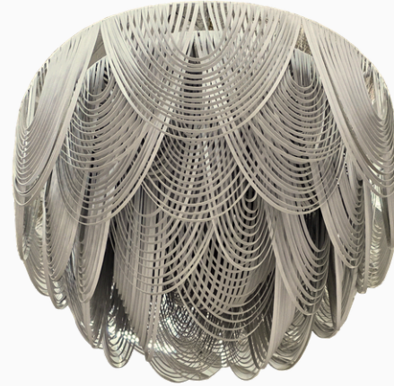
WSP FLUSH 120 - CREAM LEATHER VIEW FROM BELOW