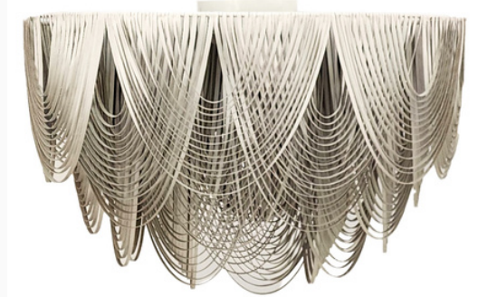
WSP FLUSH 120 - CREAM LEATHER VIEW SHOWING FLUSH