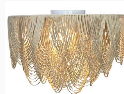
LIGHTS ON FLUSH WHITE