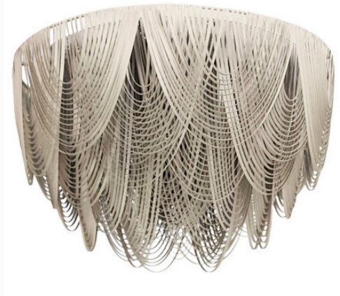
WSP FLUSH 120 - CREAM LEATHER 120CM DI X 80CM H (INCL 5CM FLUSH) X25KG 9 X E27 GLOBES (ambient light) 5CM FLUSH