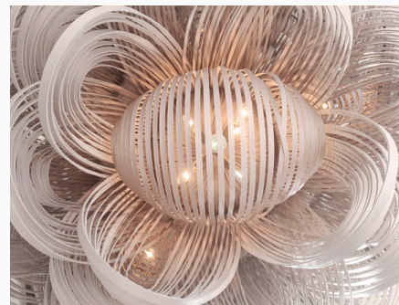
VIEW FROM BELOW