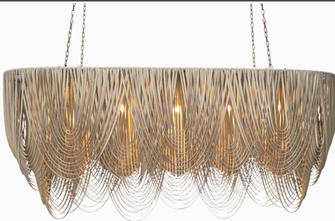
WSP OVAL 170 - CREAM LEATHER 170M DI X 60CM DEEP X 75CM H X 20KG 5 X E27 GLOBES (ambient light) X4 CHAINS OF 1M + X2CEILING CUPS