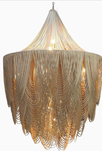
WSP T 120 - CREAM LEATHER 120CM DI X 165CM H X 26KG 14 X E27 GLOBES (ambient light) 1M CHAIN