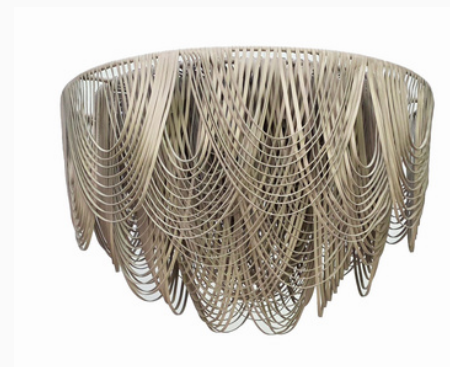
WSP FLUSH 92 SHORT - CREAM LEATHER 92M DI X 65CM H(INCL FLUSH) X 20KG 5 X E27 GLOBES (ambient light) 5CM FLUSH GOLD